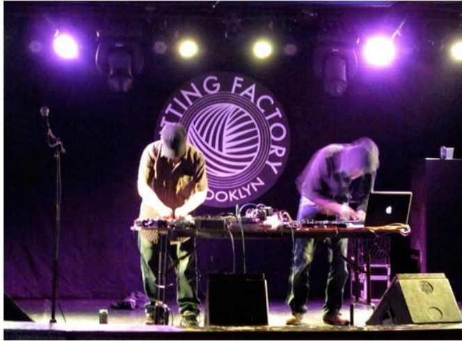
A lo grande: en la mítica Knitting Factory, en Nueva York.