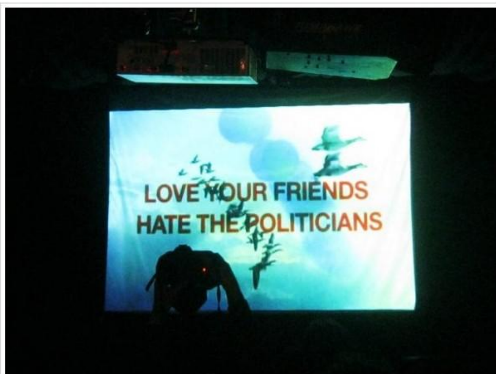
The Suicide Of Western Culture

Some sort of military march gives way to dark distorted drones as the screen shows images of blood and brutality which it quickly becomes clear are old newsreel footage from the Spanish Civil War. Two black-hooded figures stand underneath, twisting switches on a particularly laden version of the modern electronica artist's Table Of Interesting Stuff and nodding from the waist in time-honoured fashion to the hard-edged industrial sounds they're creating. Played as a continuous piece, the sound evolves into a more ambient landscape as the screens spin newspaper pages and still shots of destruction, before the words flash up "HOPE ONLY BRINGS PAIN" against an explosion of Fuck Buttons meets Holy Fuck progressive electro-post-rock. Finally there are cinematic sweeps and a last message: "LOVE YOUR FRIENDS, HATE THE POLITICIANS". Outstandingly powerful stuff and my favourite new (to me) band of the weekend.