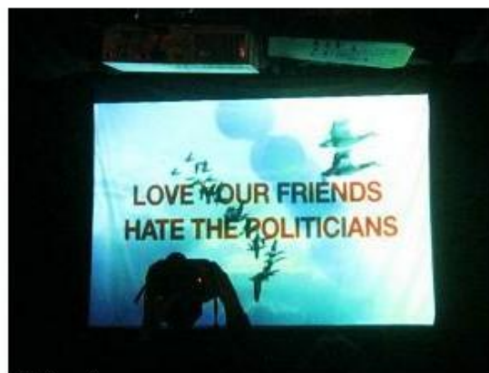
Seward, and a message from our Catalan electro-post-rock friends