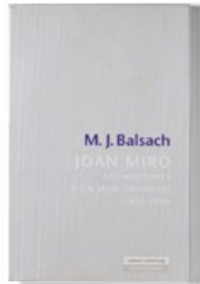
Galaxia Gutenberg, 2007 200 pages