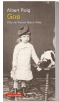
Galaxia Gutenberg, 2016 384 pages