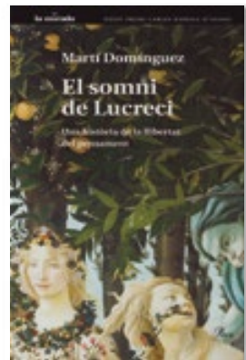
Pòrtic – Grup 62, 2013 360 pages

de Lucreci [Lucretius' Dream] examines the fascinating story of how a copy of the ancient manuscript was found in a remote monastery in Germany. Lucretius' work came to inspire Renaissance men such as Galileo and Enlightenment thinkers such as Voltaire. Later on, it sparked ideas that would lead Darwin to come up with The Theory of Evolution. The result is a book that is a jewel of erudition and a rallying cry for free thought in the face of dogmatism.